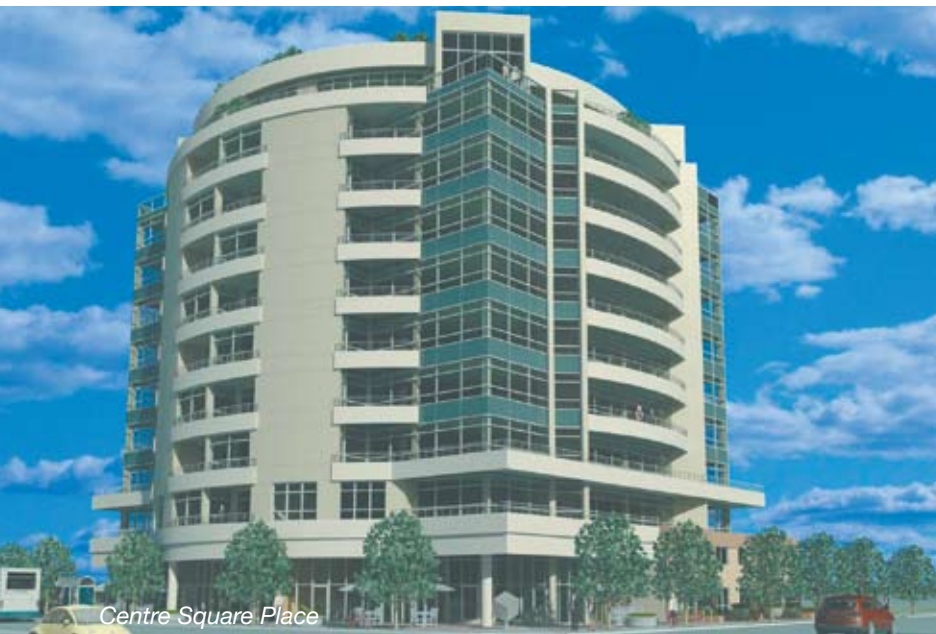
Centre Square Place